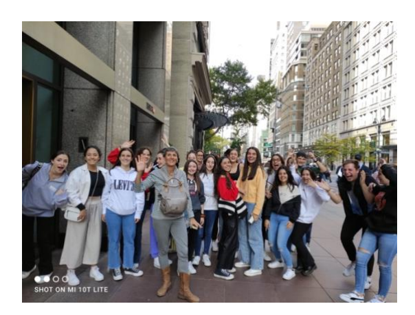
MIT & Harvard